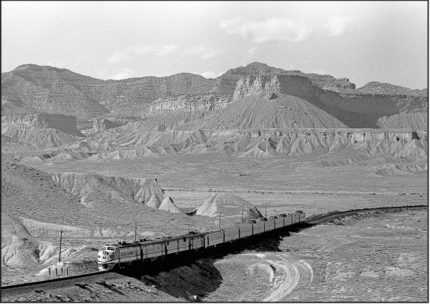
Rio Grande passenger service from the past.