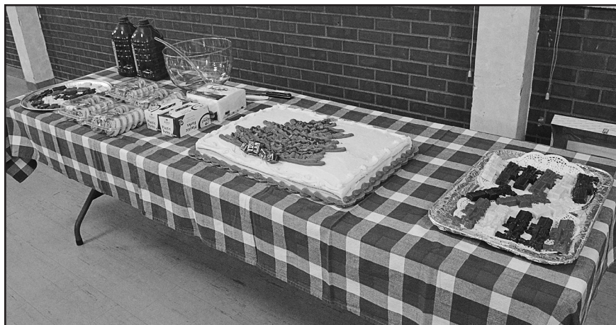
A traditional addition to the December annual meeting agenda are holiday treats.