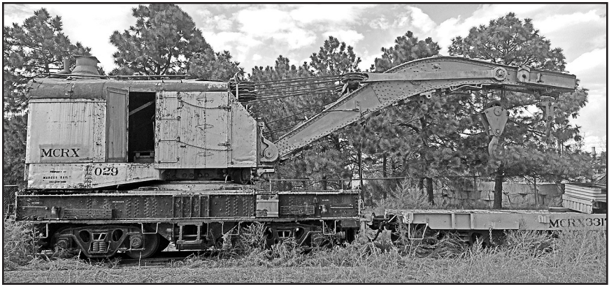
120-ton, 2-hook derrick steam crane.