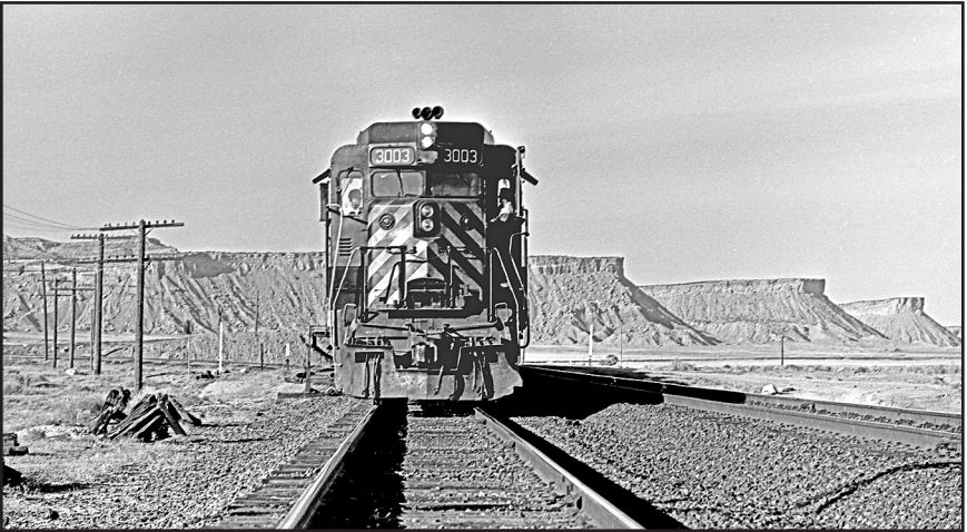
Rio Grande GP30 #3003 in the desert.

For Rail Report 688, the masthead photo features D&RGW 688, a 2-8-0, outside the Denver Roundhouse on October 1, 1938.