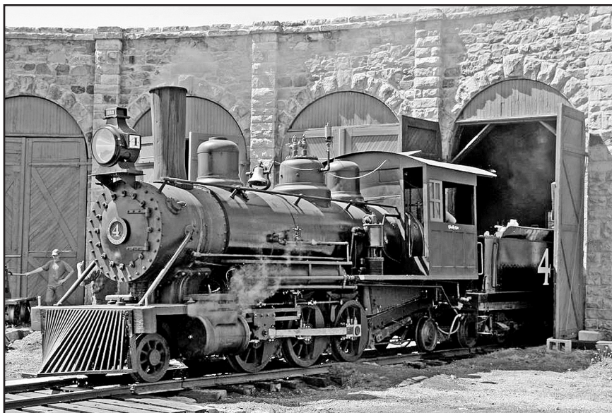
Klondike Kate backing into the Como Roundhouse on September 2, 2017.