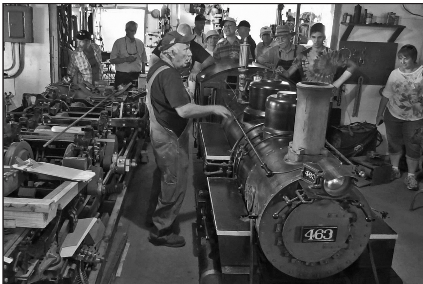
The Club tour of the Uhrich Locomotive Works locomotives under construction and a demonstration in the foundry.