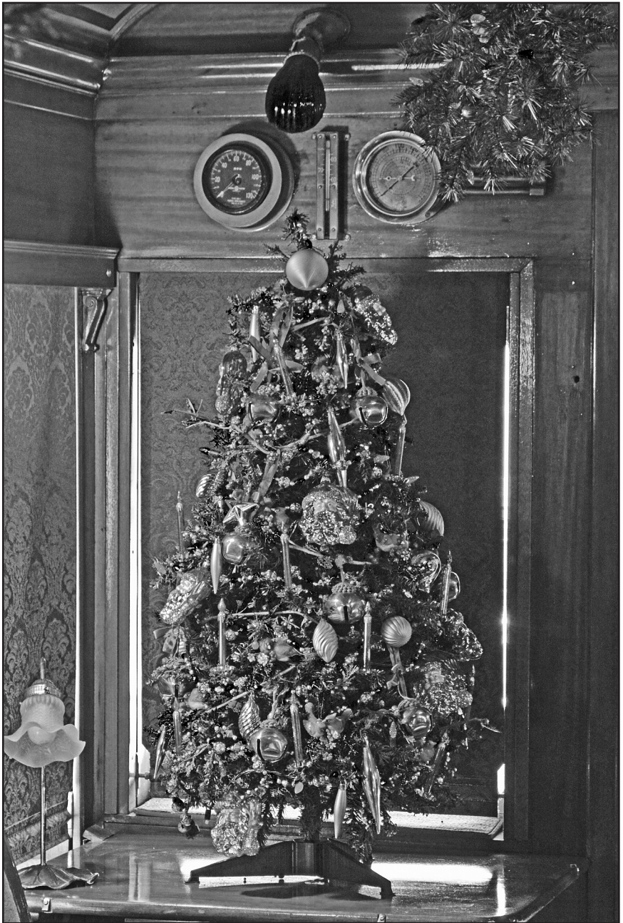
Blue level ticket holders enjoy the lavishly decorated CB&Q Business Car No. 96.