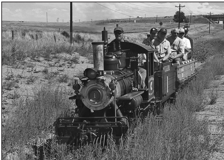
The Club riding behind a 15-inch gauge locomotive on the Comanche Crossing & Eastern Railroad.