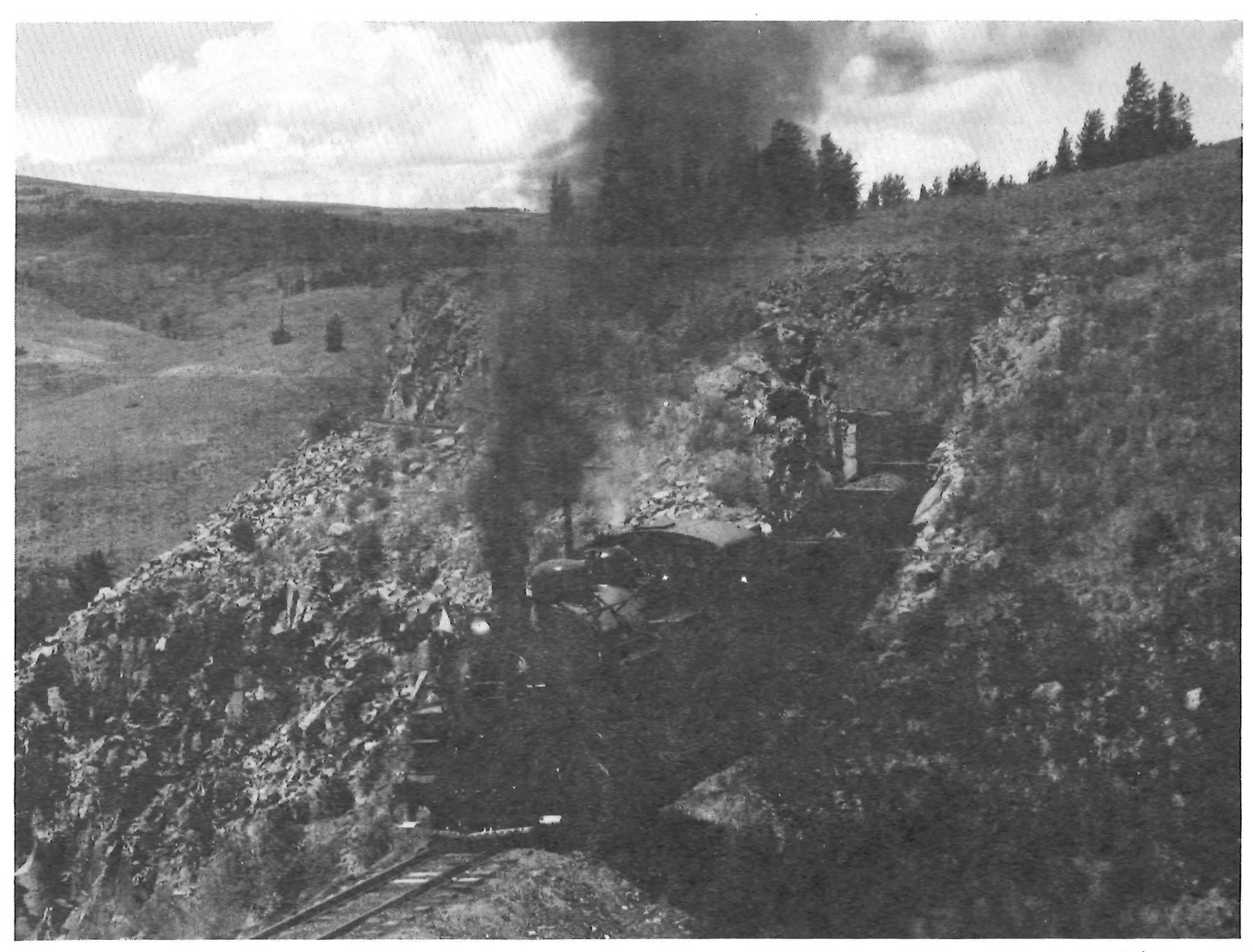
Cumbres & Toltec Scenic Railroad #484 is seen coming through a rock cut east of Osier, June 29, 1991. The Engine had been relettered for the Rio Grande for Jim Trowbridge's special freight train and also sported a brand new paint job, less than 24 hours old!!