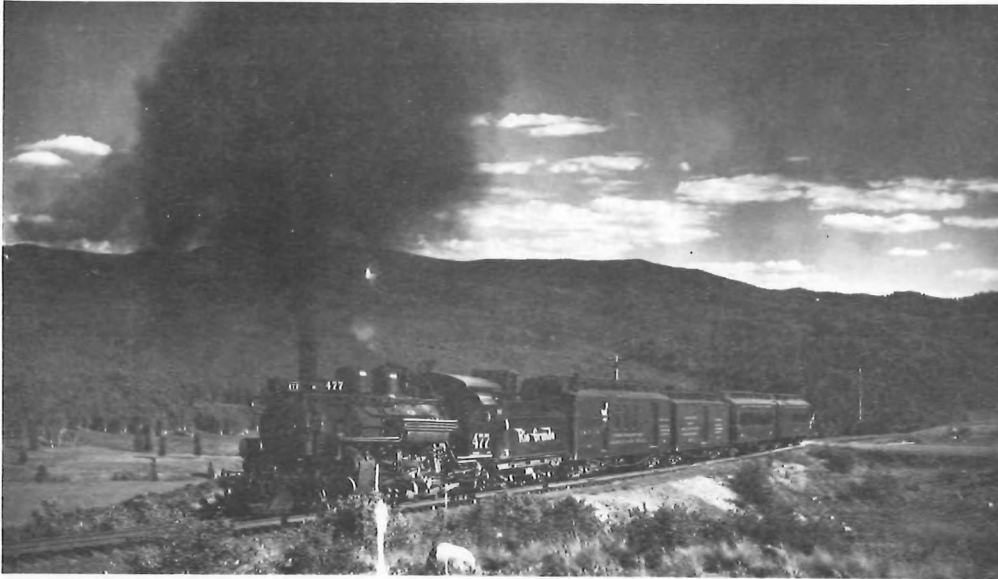
Denver & Rio Grande engine #477 with Train #116, the eastbound San Juan, wends its way up Combres Pass near Cresco, Colorado, on a beautiful July 2, 1941.