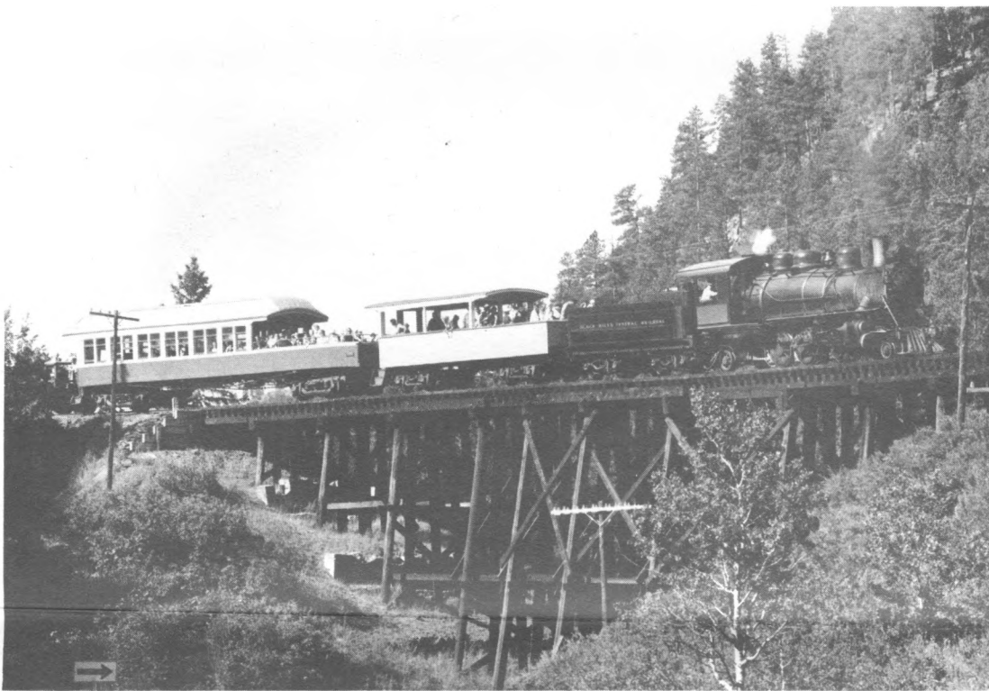
BLACK HILLS CENTRAL locomotive No. 7, a 2-6-2 type steam engine, heads across one of the many trestles on the line between Hill City and Deadwood, South Dakota. The ROCKY MOUNTAIN RAILROAD CLUB'S special train will be pulled by this locomotive and a couple of the open cars will be carried in the train.