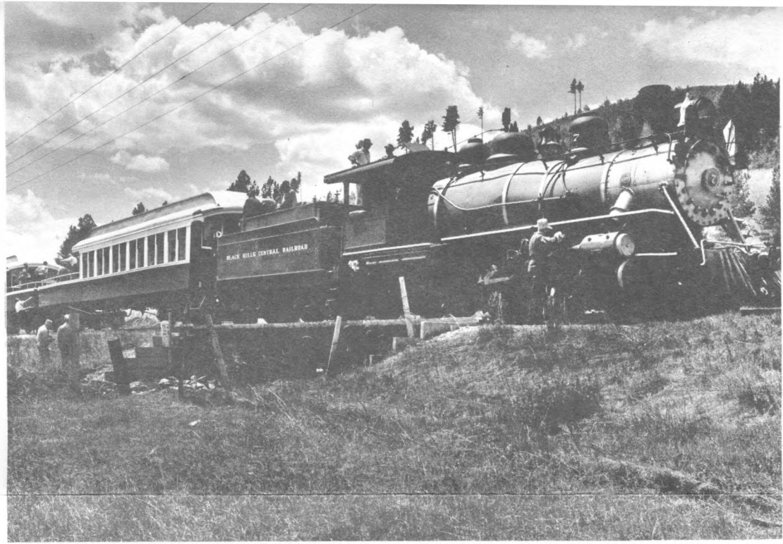
While her engineer oils around, engine No. 7 of the BLACK HILLS CENTRAL RAILROAD pauses to have her picture taken in the mountainous terrain typical of that found along the branch line from Hill City to Deadwood, in the Black Hills of South Dakota.

time, is offering its members and friends a rare ed passenger train through the beautiful Black at least one completely open car. The Black -Keystone run, seldom schedules a passenger train inal in Hill City to the historic old town of