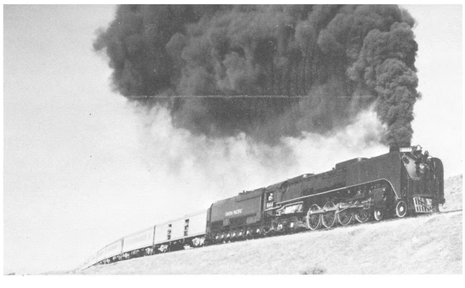
8444 rounds curve just south of Dent

de luxe coaches, a lunch-counter diner, and a fully stocked observation-lounge car. A convenient feature of this trip is that buffet-style meals will be served in the lunchcounter diner during the entire trip. All meals are included in the price of your ticket and they will be served on trays that may be carried to your coach seat. You may return for "seconds" as often as you wish.