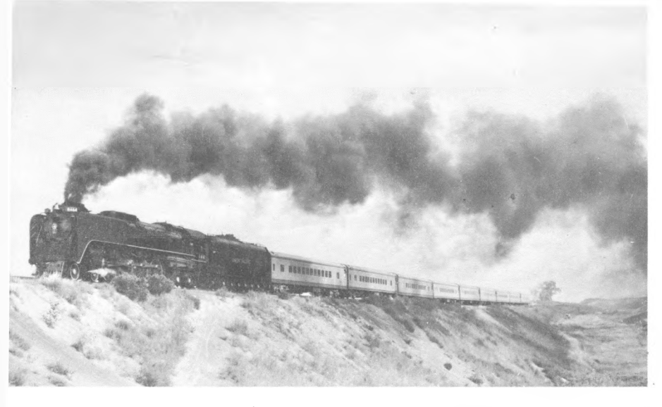
8444 approaching Welby on the Dent Branch

On Saturday, May 30, 1970, at 7:30 a.m., Mountain Time, another Rocky Mountain Railroad Club special train will depart from Denver Union Station behind Union Pacific steam locomotive No. 8444, a massive 4-8-4 type, en route to Laramie, Wyoming. Passengers on U. P. No. 111, City of Denver, should detrain at LaSalle and board our train upon arrival. Our train will not go via Cheyenne. It will be routed over the little-used freight-only Dent Branch north of Denver to LaSalle. At LaSalle, we rejoin the main line, make a service and passenger stop at Greeley, and then climb through the rolling hills of northern Colorado. Shortly after entering Wyoming, we begin our climb over Sherman Hill via the Harriman Cutoff and descend through the vast Laramie Valley to Laramie, Wyoming, where another service stop will be made. Our Laramie stop will give you ample time to observe and photograph heavy traffic on the Union Pacific main line.