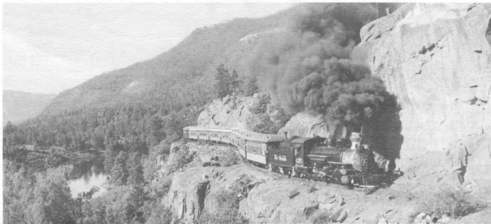
APPROACHING ROCKWOOD, COLORADO

THE ROCKY MOUNTAIN RAILROAD CLUB ONCE AGAIN IS ABLE TO INVITE YOU TO RIDE A DENVER & RIO GRANDE WESTERN NARROW GAUGE SPECIAL. OUR TRAIN WILL LEAVE DURANGO AT APPROXIMATELY 9:30 A.M. ON SUNDAY, SEPTEMBER 6TH, 1970, THE MIDDLE DAY OF THE THREE-DAY LABOR DAY WEEK-END. THE CLUB'S SPECIAL WILL FOLLOW THE REGULAR SILVERTON TRAIN AND A NUMBER OF PHOTO RUNBYS HAVE BEEN PLANNED AT SCENIC LOCATIONS IN RUGGED ANIMAS CANON.